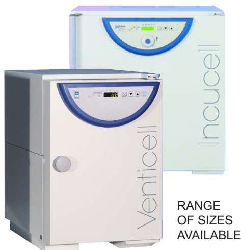
RANGE OF SIZES AVAILABLE

Call your local office today to discuss your oven and incubator needs. ●