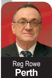
Reg Rowe Perth

PERTH 11 Challenge Blvd Wangara WA 6065 Ph: +61 (08) 9302 1911 Fax: +61 (08) 9302 1905 rowewa@rowe.com.au