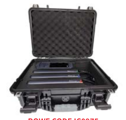
ROWE CODE IC0975