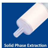
Solid Phase Extraction

HPLC, NUCLEODUR®, NUCLEOSIL®, GC, OPTIMA®, DC, SPE, CHROMABOND®, LC adsorbents, vials and caps, syringe filters, Chromafil®.