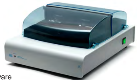
Rowe Code: IR2500

OXITEST is a multi-application accelerated oxidative stability testing device. The IR2500 directly tests the whole sample, without the need of fat separation that can affect reliability. Two separate titanium chambers offer the possibility to run the same test in tandem or different tests at the same time.