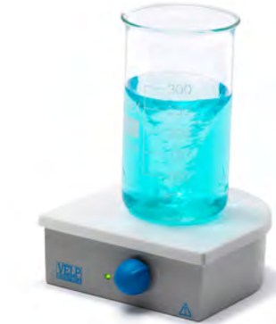
MST (Rowe Code IM2016)