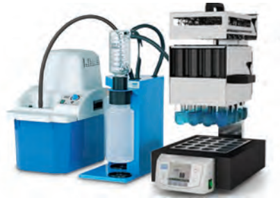
DKL WITH JP PUMP & SMS SCRUBBER