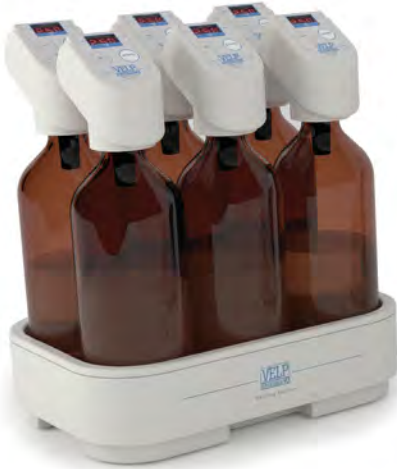
BOD EVO SENSOR SYSTEM 6 (Rowe Code NV4150)