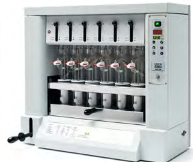
SER 148/6 Rowe Code: IS4010