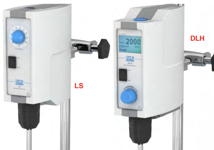
Other models available

Robust motors, technopolymer housing, digital or analog control, easy & quick setup, intuitive chuck system, full operator safety and a range of versatile shafts & paddles available.