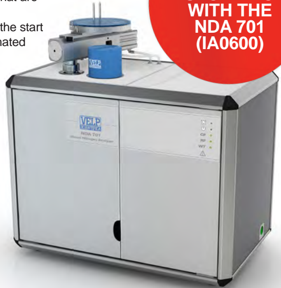
Rowe Code: IA0600

TOTAL AUTOMATION WITH THE NDA 701 (IA0600)