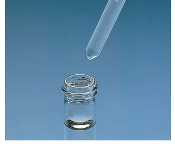
Even media with high vapor pressure (up to 500 mbar) such as alcohols, ether and hydrocarbons can be pipetted simply, reliably and with the highest accuracy.