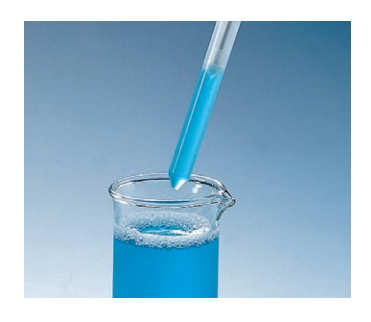
Media which tend to foam, such as tenside solutions, pose no problem to the Transferpettor.