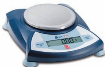
Scout Pro with Round Platform (4.7 in / 12 cm diameter)

600g x 0.1g 2000g x 0.1g 4000g x 0.1g 6000g x 0.1g 6000g x 1g