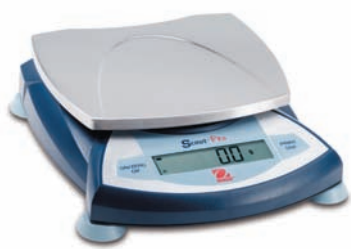
Scout Pro with Square Platform (6.5 x 5.5 in / 16.5 x 14.2 cm)

600g x 0.1g 2000g x 0.1g 4000g x 0.1g 6000g x 0.1g 6000g x 1g