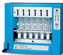
SER148/6 Solvent Extractors Also available with 3 sample places.

See the Velp food & feed range at FOODPRO 21 - 24 July 2008, Sydney Convention Centre, stand No: 6070