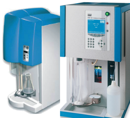
Distillation UDK series. Available: Four models from entry level to fully automatic with integrated colorimetric titration system

More Information Required? If you would like further information on any of the products featured in this edition, please contact your nearest Rowe Scientific Pty Ltd office.