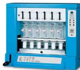
SER148/6 Solvent Extractors Also available with 3 sample places.