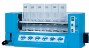
CSF6 Dietary Fibre Extractor Enzymatic method extraction