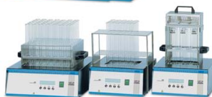
Digesters Velp DK series. Available: 6, 8, 20 x 300 ml samples and 20, 42 x 100 ml sample units