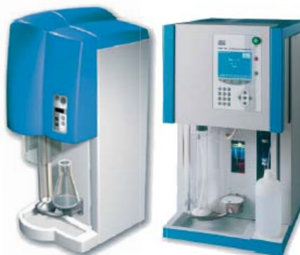
Distillation UDK series. Available: Four models from entry level to fully automatic with integrated colorimetric titration system