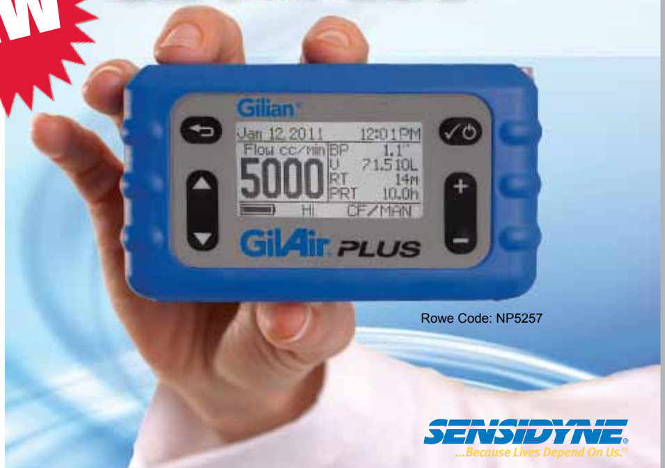
Rowe Code: NP5257

Contact your local Rowe Scientific office to discuss your requirements