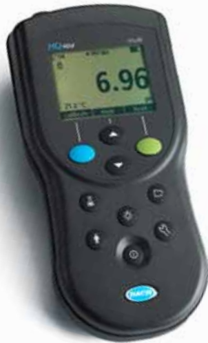
Rowe Code: IM6700