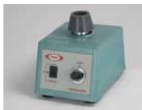
Rowe Code IV1040

SPECIAL Price Purchase the ever popular and ever reliable Ratek VM1 Vortex Mixer for the special price of $298 ex. GST