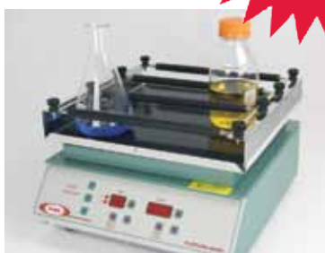
Rowe Code IO1005

FREE Universal Rack Purchase an OM6 Digital Orbital Mixer for the special price of $1,672 ex. GST and receive a FREE RR5 universal rack Rowe Code IR2020