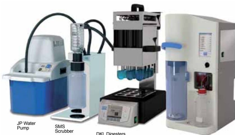
JP Water Pump