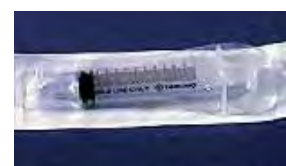
Single Use Syringe