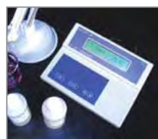
Benchtop pH Meters