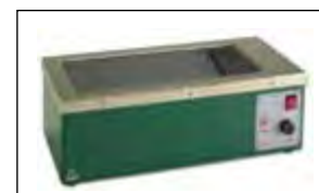
Ratek Water Baths