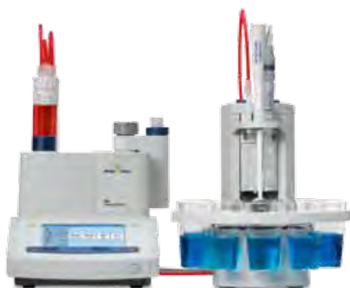
TITRATOR AUTOMATIC, G20A, COMPLETE WITH ELECTRODES, BURETTES AND SAMPLE CHANGER

The Rowe Scientific Pty Ltd range of laboratory equipment is comprehensive and too vast to list in one catalogue. If you cannot see what you are looking for here please call our office or use our search facility on our web store at www.rowe.com.au