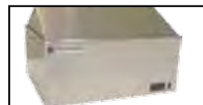
Thermoline Water Baths